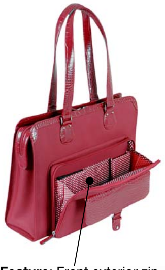
Feature: Front exterior zip around compartment Benefit: to keep personal items separate & in easy reach from laptop section