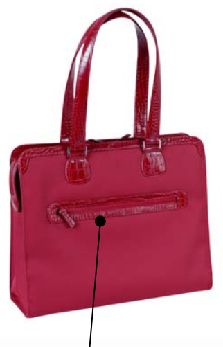
Feature: Rear zippered